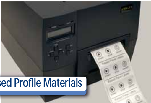
Raised Profile Materials