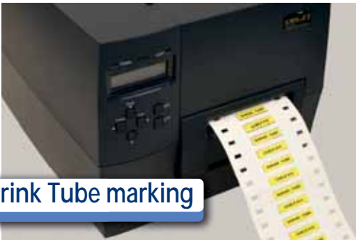
Shrink Tube marking